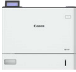
i-SENSYS X 1871P