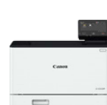
i-SENSYS X C1333P