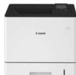
i-SENSYS X C1538P II