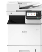
i-SENSYS X C1533iF II