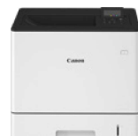
i-SENSYS X C1533P II