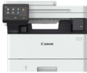
i-SENSYS X 1440i