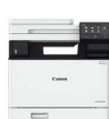
i-SENSYS X C1333iF