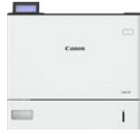
i-SENSYS X 1861P