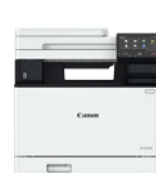
i-SENSYS X C1333i