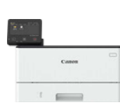
i-SENSYS X 1440P