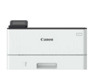
i-SENSYS X 1440Pr