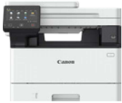
i-SENSYS X 1440iF