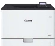
i-SENSYS X C1946P