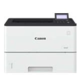
i-SENSYS X 1643P